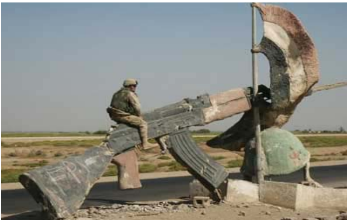
To fire this weapon just kick with the heel of your foot and hold on tight!