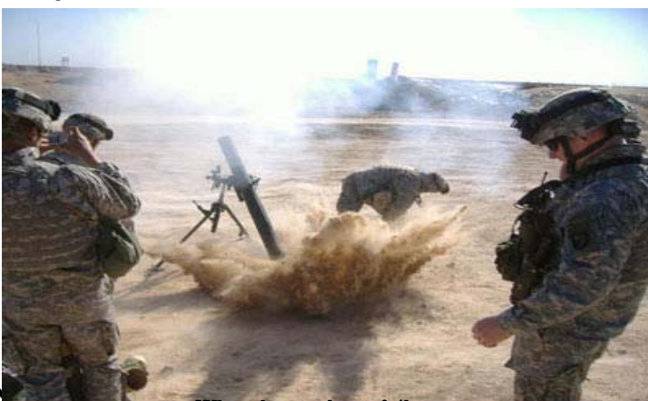
When base plates fail.