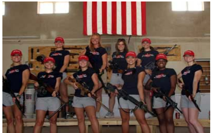
As an incentive for men to join the infantry, the Marines and Army have allowed certain women to also sign up as grunts.