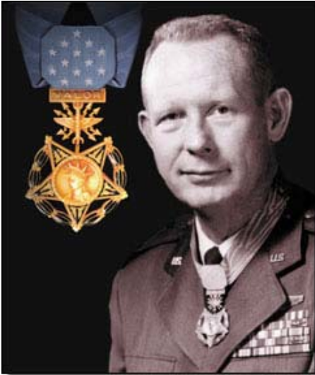
Major Bernard Francis Fisher, USAF.

Citation: For conspicuous gallantry and intrepidity at the risk of his life above and beyond the call of duty. On that date, the US Army special forces camp at A Shau was under attack by 2,000 North Vietnamese Army regulars. Hostile troops had positioned themselves between the airstrip and the camp. Other hostile troops had surrounded the camp and were continuously raking it with automatic weapons fire from the surrounding hills. The tops of the 1,500-foot hills were obscured by an 800 foot ceiling, limiting aircraft maneuverability and forcing pilots to operate within range of hostile gun positions, which often were able to fire down on the attacking aircraft. During the battle, Maj. Fisher observed a fellow airman crash land on the battle-torn airstrip. In the belief that the downed pilot was seriously injured and in imminent danger of capture, Maj. Fisher announced his intention to land on the airstrip to effect a rescue.