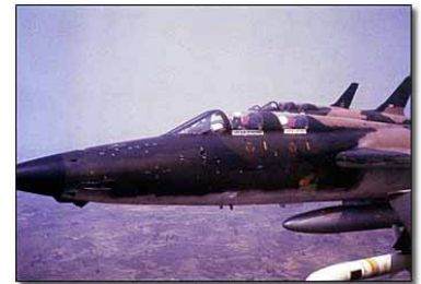
Lt. Col. Dethlefsen flying the Republic F-105F

Dethlefsen's flight. In the initial attack on the defensive complex the lead aircraft was crippled, and Maj. Dethlefsen's aircraft was extensively damaged by the intense enemy fire. Realizing that the success of the impending fighter bomber attack on the center now depended on his ability to effectively suppress the defensive fire, Maj. Dethlefsen ignored the enemy's overwhelming firepower and the damage to his aircraft and pressed his attack. Despite a continuing hail of antiaircraft fire, deadly surface-to-air missiles, and counterattacks by MIG interceptors, Maj. Dethlefsen flew repeated close range strikes to silence the enemy defensive positions with bombs and cannon fire. His action in rendering ineffective the defensive SAM and antiaircraft artillery sites enabled the ensuing fighter bombers to strike successfully the important industrial target without loss or damage to their aircraft, thereby appreciably reducing the enemy's ability to provide essential war material. Maj. Dethlefsen's consummate skill and selfless dedication to this significant mission were in keeping with the highest traditions of the U.S. Air Force and reflect great credit upon himself and the Armed Forces of his country.