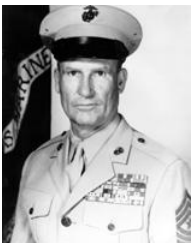
5th sergeant major of the Marine Corps dies at 90 on July 5 2007.