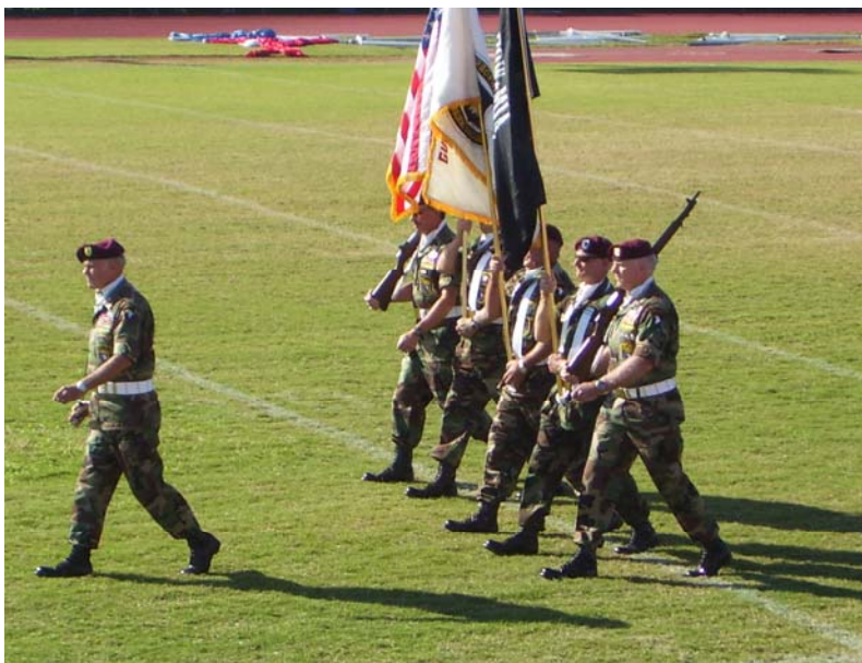
Pictured above, at the Clearwater Veterans Appreciation Day, left, is one of the Special Operations members who made a free fall jump. There were four retired US Army Special Forces Lt. Colonels who agreed to make this day time (Hollywood) PR jump each carrying a flag of each service branch. No active duty Special Operations personnel were available due to heavy deployments to combat zones. Pictured (right) are a group of old but still bold ex-paratroopers form the 1st Airborne Brigade.